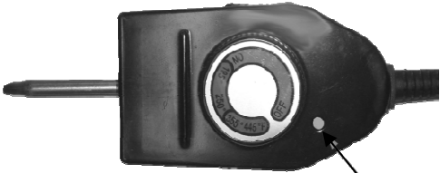
Power / Temperature Indicator Light